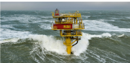
Examples of new ComFLOW application areas: Left: test with free fall life boat Right: offshore monopile platform in heavy weather

The joint industry project runs parallel to the identically-named research project ComMotion, which is financed by the Dutch government and supports 2 PhD students, a post-doc and validation model tests. The results of this research project are made available to the ComMotion JIP.